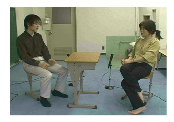
Figure 1: Example of minimum invasive counselling conversation.

We did not control the topic of counselling. The advantage of using conversations in the study group over using role-playing conversations (e.g., (Belvin et al., 2004)) was that the clients talked about their real problems. We were able to witness conversations that were from emotionally depressed or confused participants. Although some professionals can play the role of patients, client diversity cannot be achieved by such role play. Sometimes participants hesitated to openly describe their problems, and therefore, the therapists occasionally failed to grasp the client's problems, and the counselling sometimes failed or did not produce sufficient change in participants. These irregularities are of